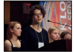
Junior high youth led in prayer.