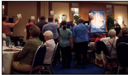
Dedicating the offering.