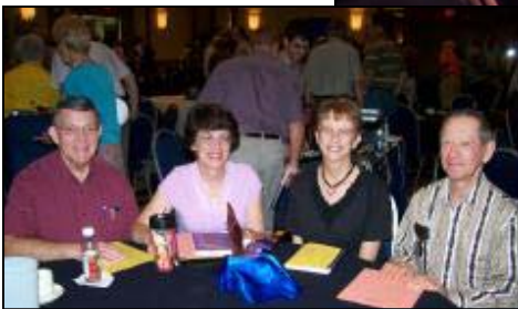
↓Food and fellowship.↑