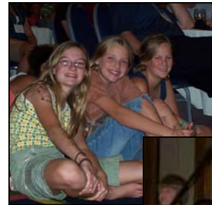
Children and youth also participated in the conference.