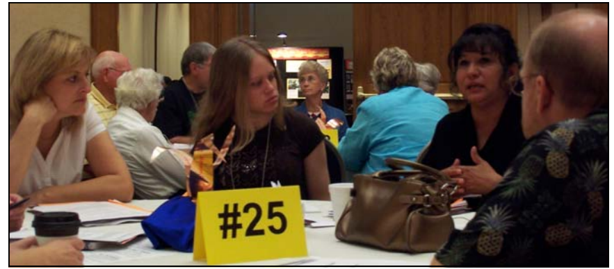
Delegates at work in table groups.